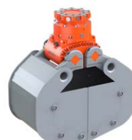
optional bolt-on side walls