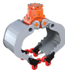
optional 4-Grip gripping device